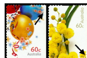
Partial printed perforation