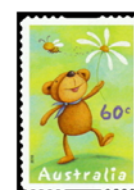
No printed perforation