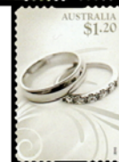
Full printed perforation